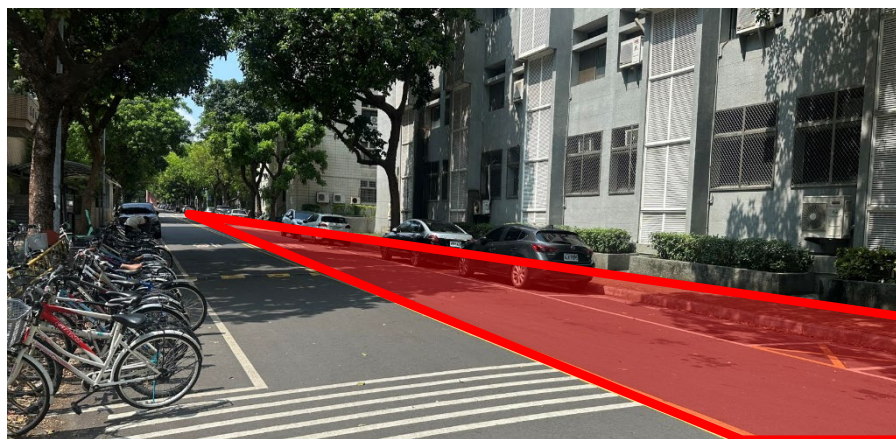
West side of the Chemistry Building