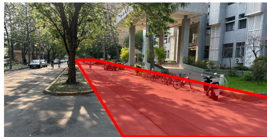
South side of the Chemistry Building

2026/5/29 7:00 a.m. to 5:00 p.m. Parking is prohibited on roads surrounding the construction area.